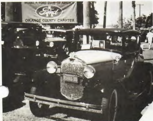
ALL FORD PICNIC